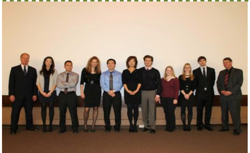
Congratulations on the chartering of Epsilon Rho and Epsilon Upsilon!!!